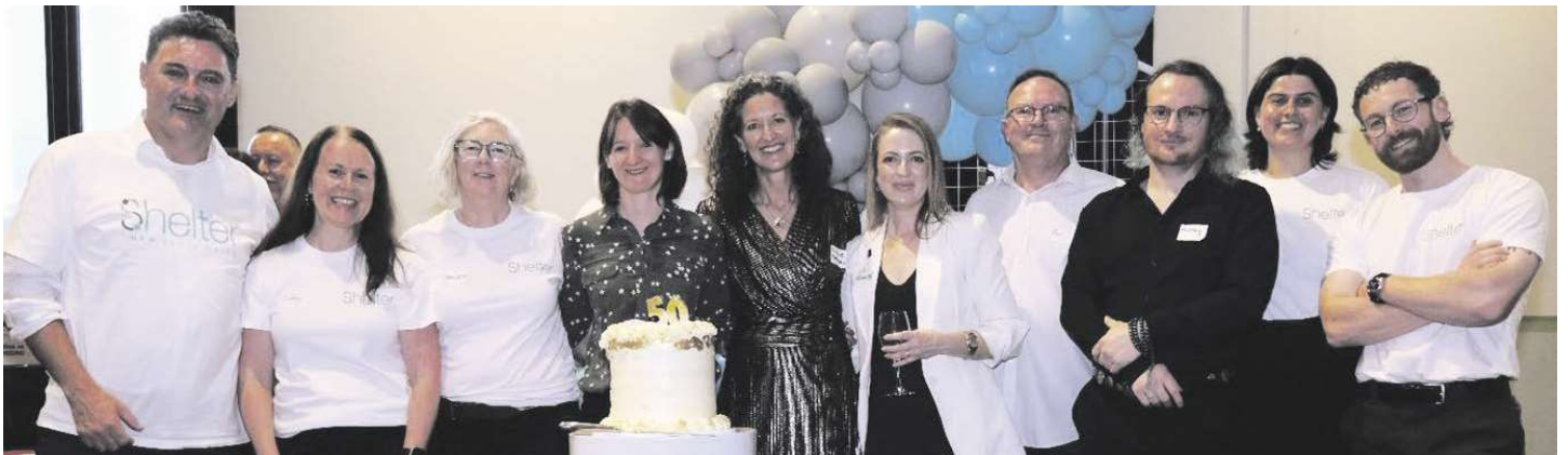
Shelter NSW staff and board members celebrate their 50th anniversary.