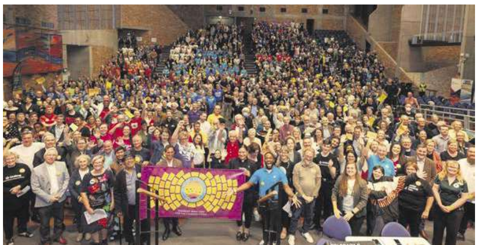
Shelter NSW was a founding member of the Hunter Community Alliance, 2024.

"While much has changed through Shelter's five decades, in terms of their